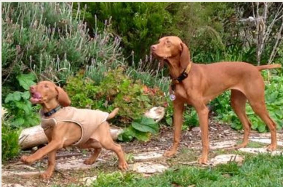
Swagger (left) & Sky