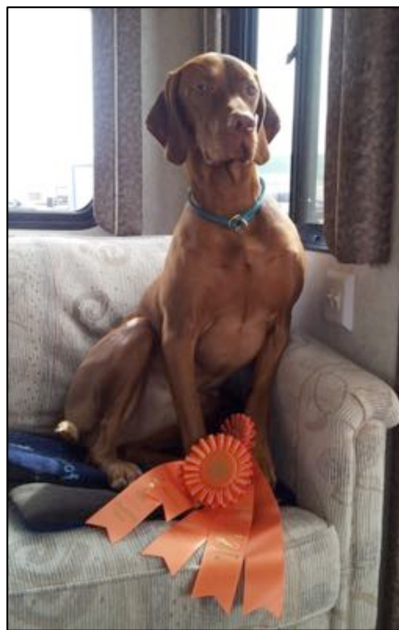
Stella GCH CH Jaybren's Quite the Stellar Lady RN JH got her Junior Hunter title!