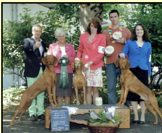
Kelley with her sons Cagney and Tucker

6xBOSS, Am/Can CH, Am/Can/Int CH Jaybren's Cover Girl of Tierah JH CGC - Kelley was our "Queen Bitch". Kelley was awarded BOS in Specialty Show six times and received Awards of Merit at the VCA National and the Canadian National Specialty. Kelley won Best of Winners at two specialty shows, finished her Junior Hunter, and at 10 years old completed two titles from the veterans class - her Grand Championship with four major wins (including a 5-pt specialty major at PSVC – over top specials) and her CGC. But her most memorable accomplishment was winning Select Bitch at 13 years old at the PSVC 2015 Specialty, for another 5 Pt GCH major.