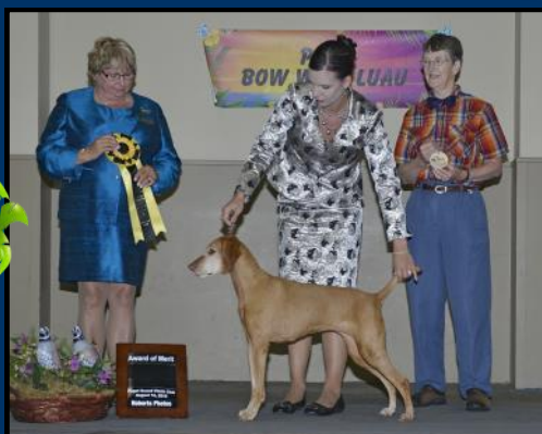
AWARD OF MERIT CH Jaybren's Bonfire Konyak CDX, RE