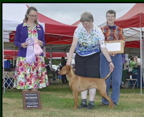
BEST OPPOSITE SEX PUPPY IN SWEEPSTAKES CH Kelby Creek's Annie Oakley