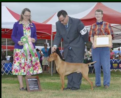
BEST OF PUPPY IN SWEEPSTAKES Kelby Creek's Wild Bill