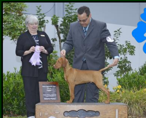
BEST OPPOSITE SEX 4-6 MONTH PUPPY Baroque's Smokin' Hot Black Ice