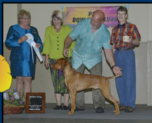
SELECT DOG CH Dezertfyre's Wild Blue Yonder