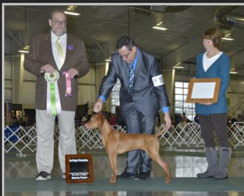
BEST OF PUPPY IN SWEEPSTAKES Eastwind Baroque's Hot Steppa