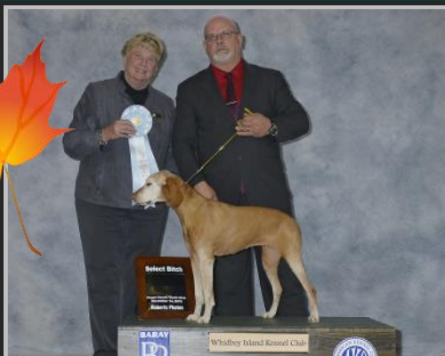
SELECT BITCH GCH Jaybren's Covergirl of Tierah JH CGC