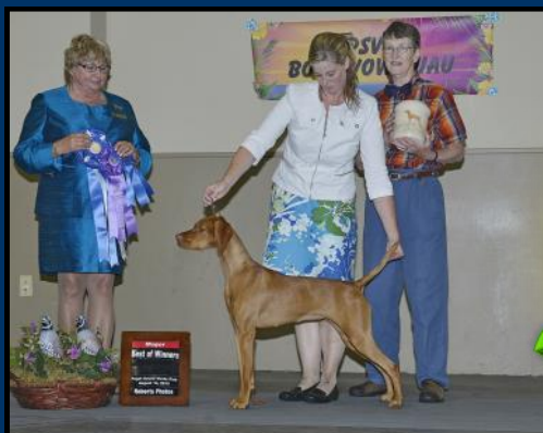
BEST OF OPPOSITE SEX GCH CH Dezertfyre's Captain's First Mate CDX RN JH AXJ OA CGC