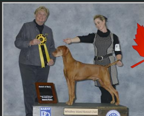
AWARD OF MERIT GCH Jaybren's Irish Star