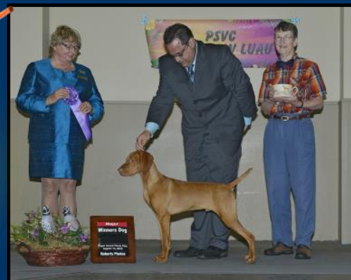
WINNER'S DOG Baroque Eastwind's Rude Bwoy Rockas