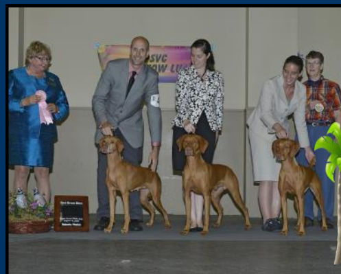
BEST BROOD BITCH GCH Tierah's Ernest Hemmingway RN