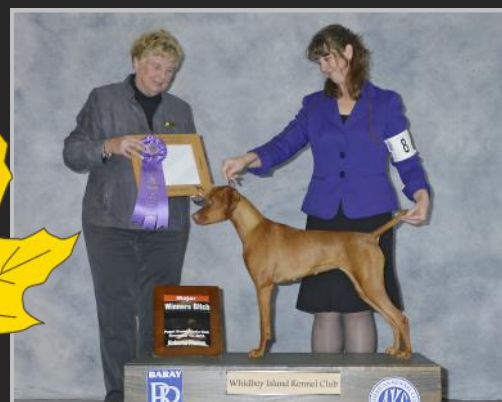
WINNER'S BITCH Sokoldal's B'Rockn Haut Huntress