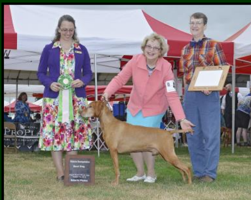
BEST VETERAN DOG IN SWEEPSTAKES GCH Poquito's Oro Jag in Pursuit RN JH OA OAJ XF