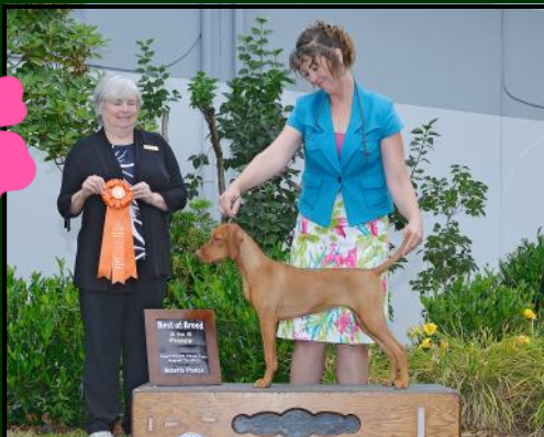
BEST OF BREED 4-6 MONTH PUPPY Sokoldalu-Soleil Vin Rouge Du Capataine