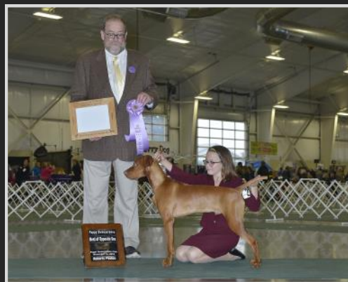
BEST OPPOSITE SEX PUPPY IN SWEEPSTAKES Sweet Pepper's Slice of Habanero