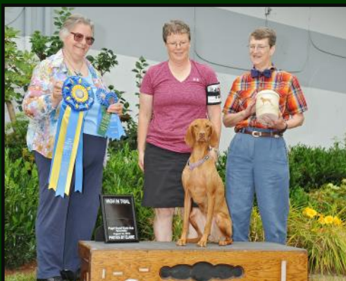
HIGHEST SCORING DOG IN REGULAR CLASSES FOR OBEDIENCE Reilloc's Benelli NA NAJ RN

Obedience