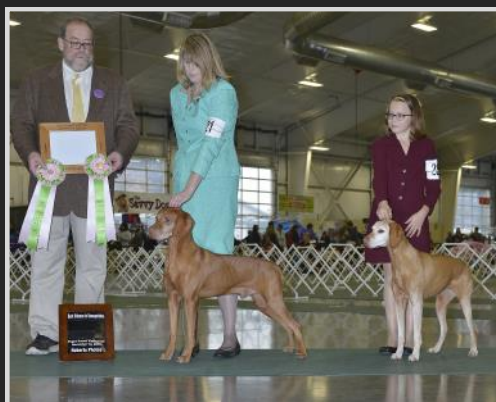
BEST VETERAN DOG IN SWEEPSTAKES GCH Jaybren's Irish Star