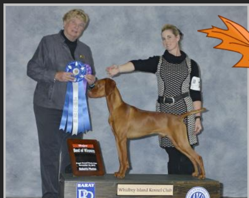
BEST OF WINNERS /WINNERS DOG Jaybren's Valid License to Kill JH