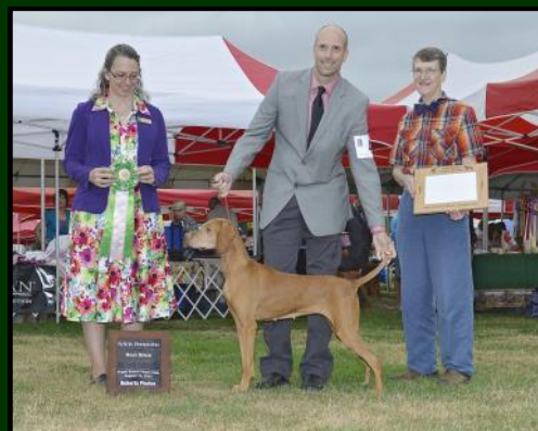
BEST VETERAN BITCH IN SWEEPSTAKES GCH Tierah's Ernest Hemmingway RN