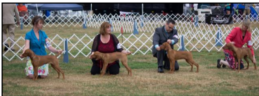
4-6 Month Puppy Competition