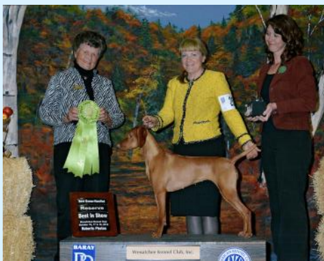
Owner Handler Series Reserve Best In Show

In three shows in Conroe Texas, and the first show in Orlando (Space Coast, I think) "Billy" CH Kelby Creek's Wild Bill was awarded BOS each day for four consecutive grand champion majors, finishing his GCH at the Space Coast Show. At Eukanuba Billy received an Award of Excellence and Best Bred by Exhibitor . Last year his mother, Cleopatra got BOS and Best Bred by Exhibitor . Although the Awards of Excellence are not ranked, the judge pointed to Billy and said "First Award of Excellence" and did not rank the other awards, so at least to me she let me know what she thought of him. Pretty good for a 15 month puppy who is still a little shy. Billy also got BOH at one of the other Orlando shows.