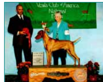
" Leia'...completed her FD in 3 runs averaging 85!"