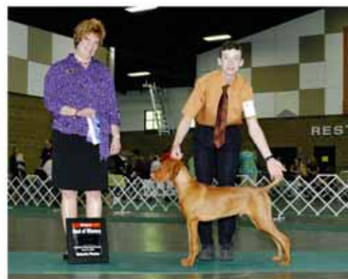
Riker and Austin