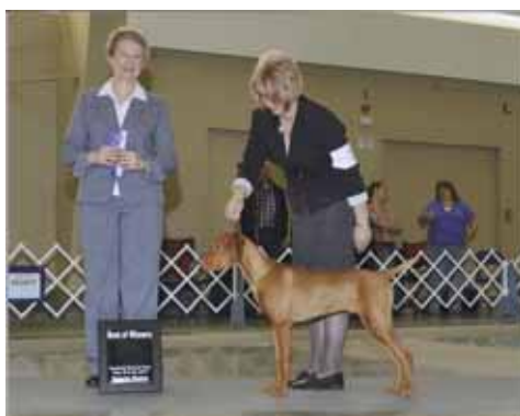
Dezertfyre's Kir Royale