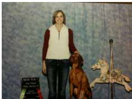
CH Tierah's Top Forty Pursuit RN