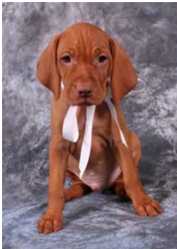
Sokoldalú-n-Tierah's Total Power Package "Brock"