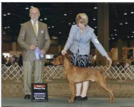
CH Dezertfyre's Crushed Ice