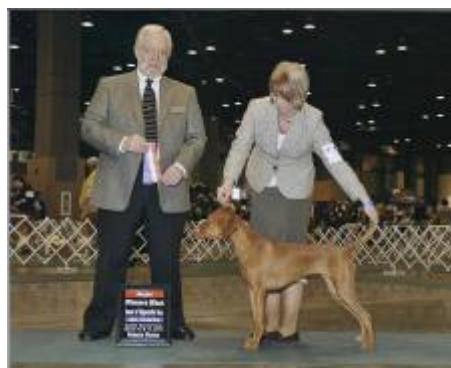
CH Dezertfyre and Ice CGC