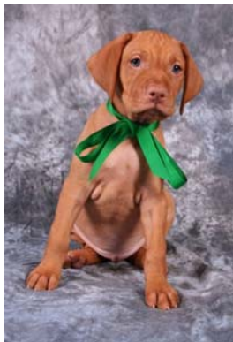
"Memphis", Tierah-n-Sokoladú's Gone in Sixty Seconds